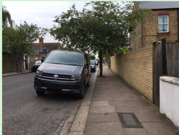
The hangar would be installed where the black van is in the images above.